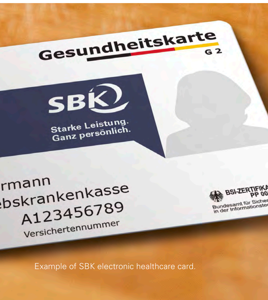
Example of SBK electronic healthcare card.

Relax when you are with SBK, because we are glad to make appointments for you with our SBK Appointments Service . Simply phone in or enter your preferred choices for doctor and date online, and we will get back to you within two days to inform you about your appointment. And the best thing is, this service is also available in English and in additional languages, such as Greek, Russian and Turkish.